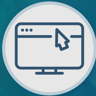
Panel PC / HMI